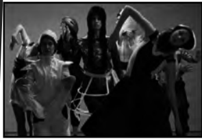
Movement/Creative Dance Das Collectif