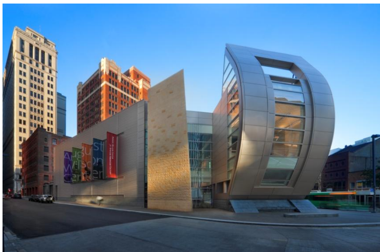
Used by permission

Adults - $8, Senior (62+) and Students with valid ID - $4