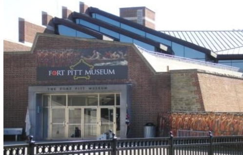
Used by permission

Adults - $5, Senior (62+) $4, Student with valid ID - $3