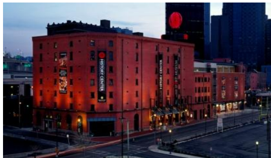
Used by permission

They are offering AOSA a ½ price deal – with appropriate ID